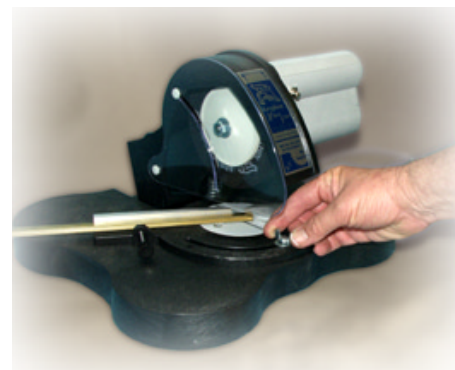
Miter table adjusts easily a full \pm 45^\circ