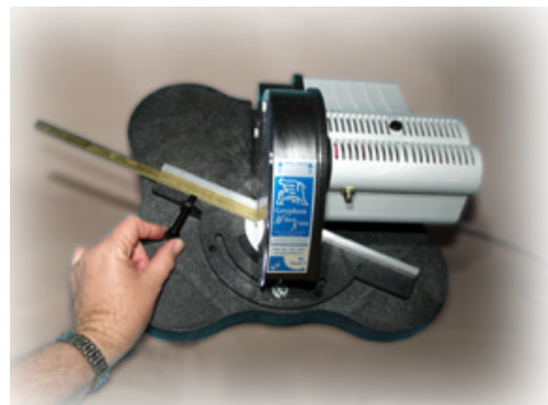
A simple clamp holds your work securely