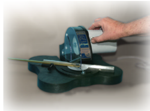
Chop saw design is fast and convenient

All mechanical components are guaranteed against failure for one year. If such a failure occurs for any reason other than abuse or misuse during this period, it will be repaired (or at our option replaced) free of charge FOB our factory. Blades will eventually wear or break, even in normal use. Their life cannot be guaranteed. Cosmetic damage is not covered under the warranty.